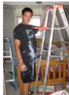
Adopt-A-Room, page 6