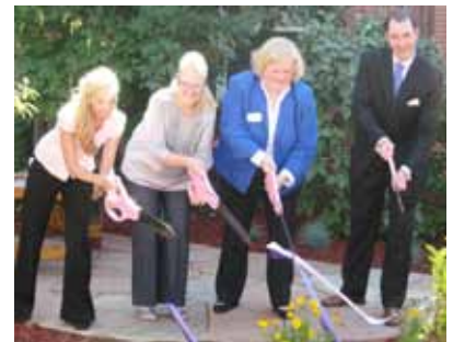
Dedicating the Mary Kay Garden, page 7