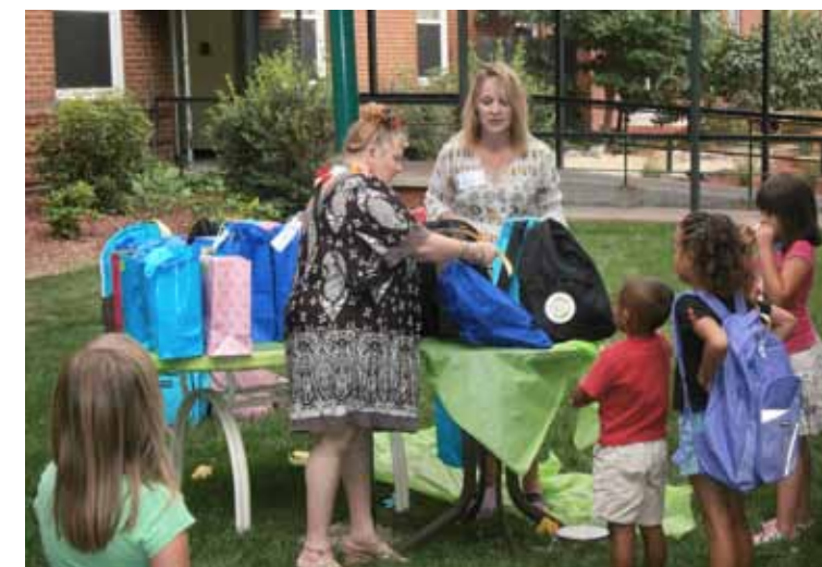
Backpacks filled with school supplies were distributed to all of the school-age children. Younger children also received a gift of an outfit and toys.

More thanks are due to the following people who made this such a special day for all: